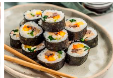
Fig. 2. Wakame (left), sea grapes (middle), Nori (right).