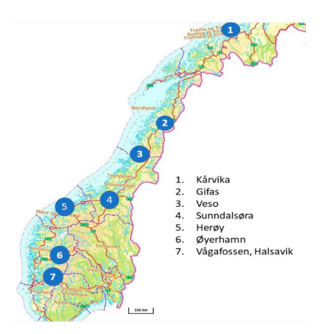
Figure 1. Location of aquaculture facilities where samples were collected.

The selection and composition of samples are presented in Table 2. We sought to represent the greatest variety of fish produced by Norwegian commercial aquaculture. The types of aquaculture facility (traditional flow through and recirculation land units, recirculating aquaculture system (RAS); large and small cage sea farms owned by the industry and research organizations) are listed in Table 2, and the geographic areas of Norway included in the study are shown in Figure 1. The production period ranged from the start of feeding to eight months in the sea. Sampling was performed within seven fully independent research projects approved by the Norwegian Food Safety Authority (approval codes 16,890, 11,814, 13,160, 8586, and 17,725) at eight sites located in different parts of Norway (Figure 1). All sampling procedures were carried out in accordance with guidelines from the Norwegian Food Safety Authority and the associated EU Directive 2010/63/EU guidelines for animal experiments. Samples of the head kidney, spleen, heart, dorsal fin, and gill were placed in RNALater (ThermoFisher Scientific, Waltham, MA, USA) and stored at -20 °C.