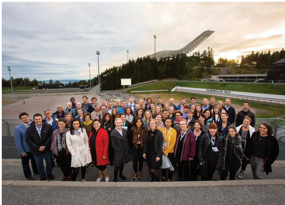
Figure 1. Participants of MHA2019, representing various sectors of aquaculture, including R&D institutes, academia, fish producers, feed companies, pharmaceutical companies, technology providers, and fish health service. The photo was taken at Holmenkollen on the way to the symposium dinner at Oslo Winter Park.