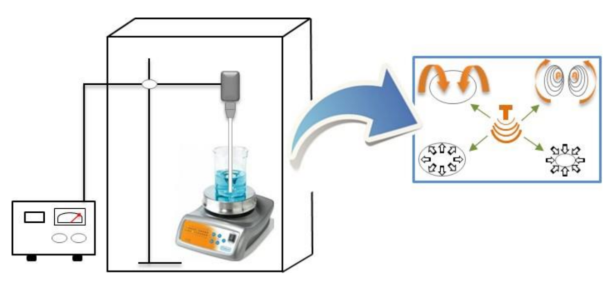
Figure 2. Schematic representation of the ultrasound-assisted extraction (UAE) process and the bubble cavitation phenomenon involved in this extraction technique.