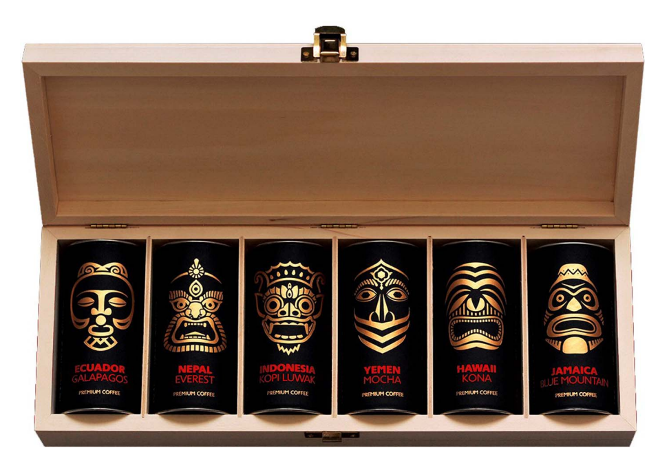
Image 1. A coffee package with red text. (For interpretation of the references to colour in this figure legend, the reader is referred to the web version of this article.)

jury of international bartenders, baristas and chefs described the coffee as the market's most tasty coffee. The coffee is to be offered in the Norwegian market with the flavors of dark roast, light roast, caramel, vanilla, chocolate and the new taste pumpkin & cinnamon. Francesco Sanapo coffee is sold in selected stores in Norway and the price is NOK 249, - for 1\,\mathrm{kg} ."