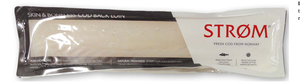
Image 3. A cod package with red text. (For interpretation of the references to colour in this figure legend, the reader is referred to the web version of this article.)