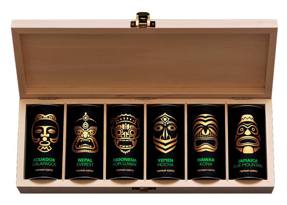
Image 2. A coffee package with green text. (For interpretation of the references to colour in this figure legend, the reader is referred to the web version of this article.)

Only the text of the flavor label on the coffee package was manipulated, and the background was kept constant (black), creating a premium association to the product (Ampuero & Vila, 2006; Ares & Deliza, 2010; Labrecque & Milne, 2013). The flavor label was manipulated for aesthetic reasons. We wanted the text on the package to look like a real product and be convincing to consumers, and thus we manipulated only the flavor label. Images 1 and 2 show the stimuli presented in Study 1.