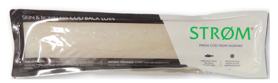
Image 4. A cod package with red text. (For interpretation of the references to colour in this figure legend, the reader is referred to the web version of this article.)

is sold in selected stores in Norway. The price for 400 g (2 servings) is NOK 120. -."