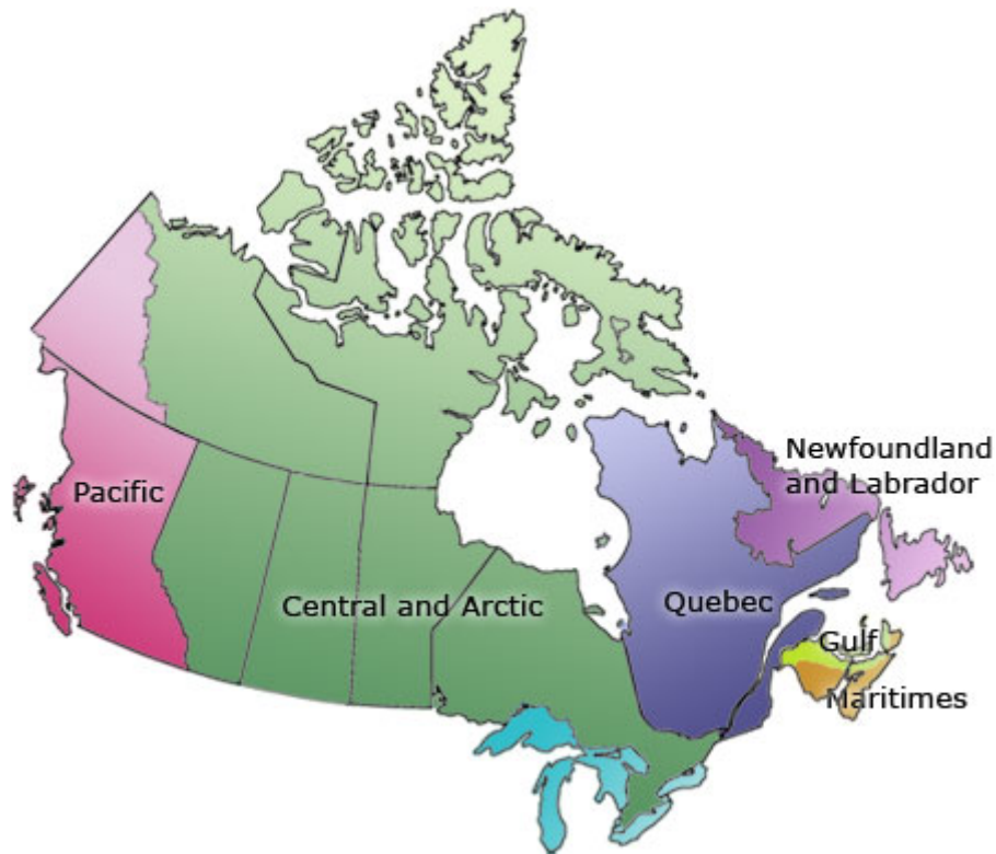
Figure 2 Map of Canada showing the six regions managed by Fisheries and Oceans Canada. Green Sea Urchins are harvested within the Pacific, Maritimes, Quebec, Gulf, and Newfoundland and Labrador regions.