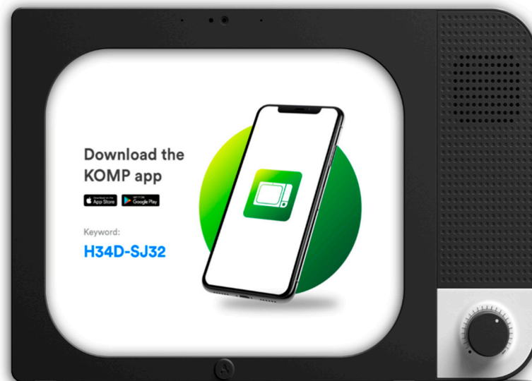
Figure 1. The Komp screen (illustration courtesy of No Isolation).

The tool is a one-button computer developed for older adults who cannot manage modern technology (Figure 1). Connected to the computer is the Komp app administrated by the family/caregivers, which connects smartphones or tablets to the Komp screen (Figure 2).