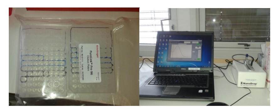
Figure 4: Left PureLink<sup>™</sup> Pro Eluation Plates with marked wells that will be used, right Nanodrop spectrophotometer connected to the computer program.