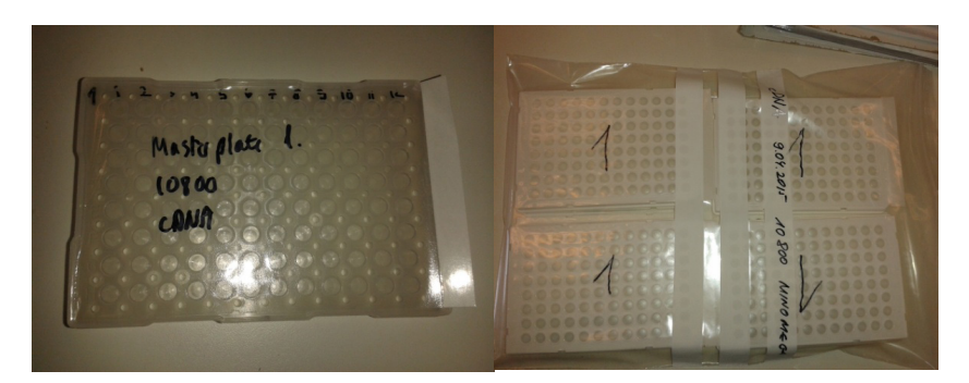
Figure 5: Left master plate 1, right 15 copies of master plate.

Next step is adding chosen primers and SybrGreen fluorescent dye to every sample before placing them into the qPCR machine.