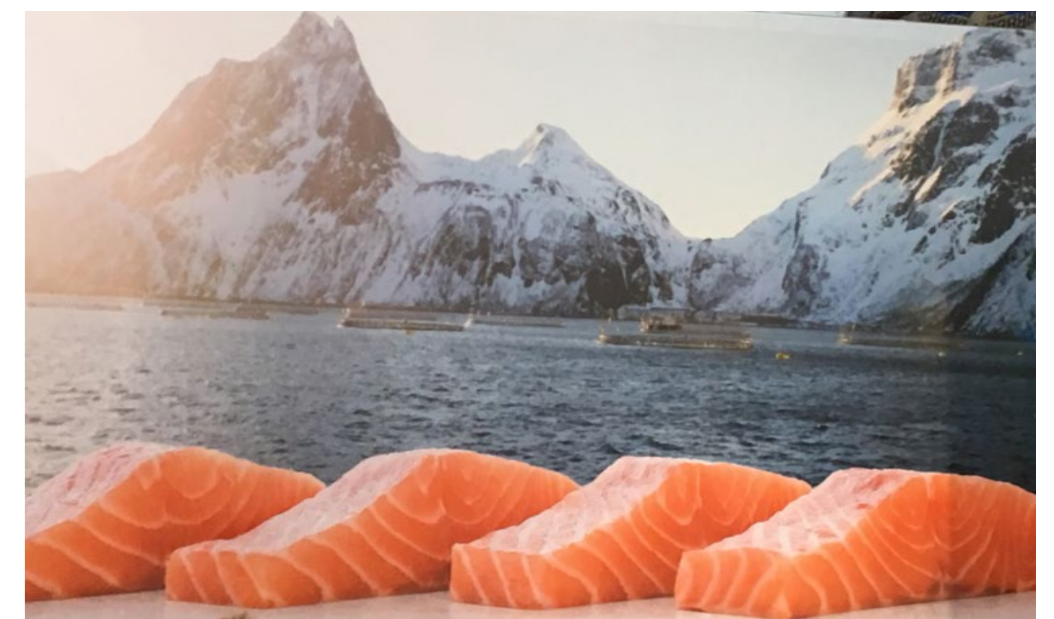
A selection of advertisements of salmon from Chile, Scotland, and Norway

QUALITY differentiation of salmon products require understanding how quality is perceived and inferred by the consumers and industrial buyers, which quality dimensions are important and how these perceptions influence decision-making.